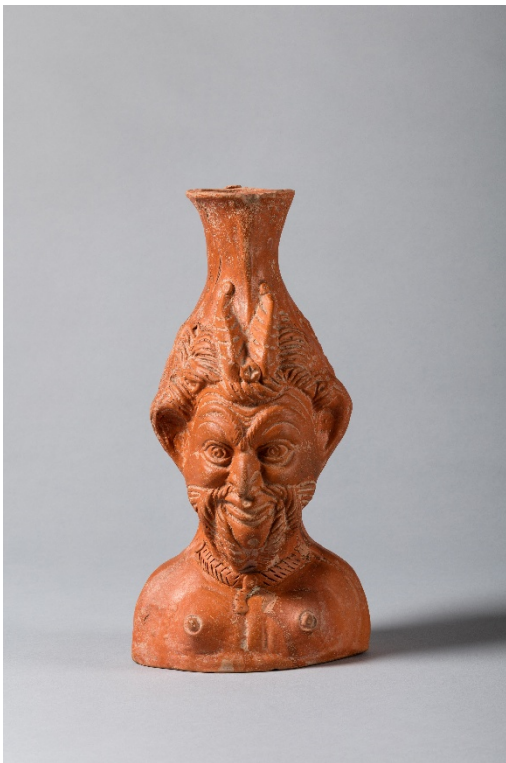
Wine pitcher shaped as a bust of the god Pan