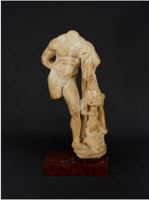
Statuette of Herakles Galerie Plektron Fine Arts, Zurich