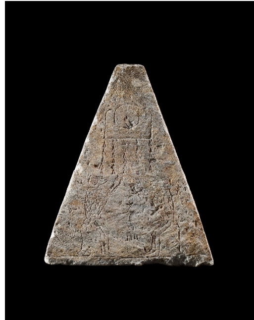
Pakharu Pyramidion Galerie Eberwein, Paris