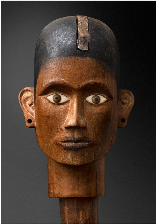
Head of a "Tau-Tau" figure Bigler Fine Arts, Zurich