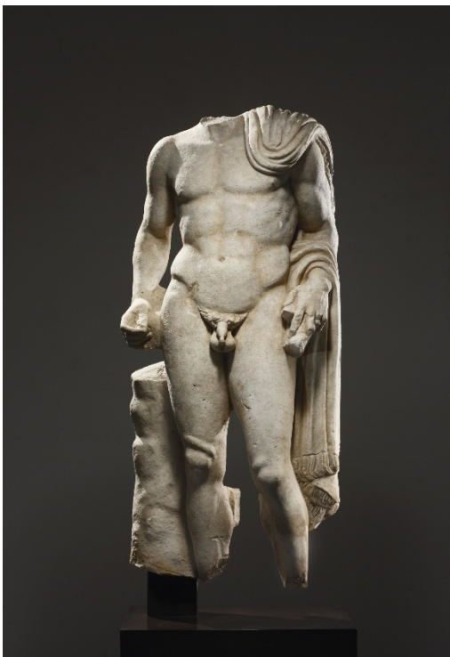
Headless marble statue Galerie Cahn, Basel

All images are available in high resolution at www.antike-in-basel.com/de/downloads/