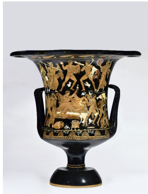
Large Apulian Calyx Krater Galerie Günter Puhze, Freiburg